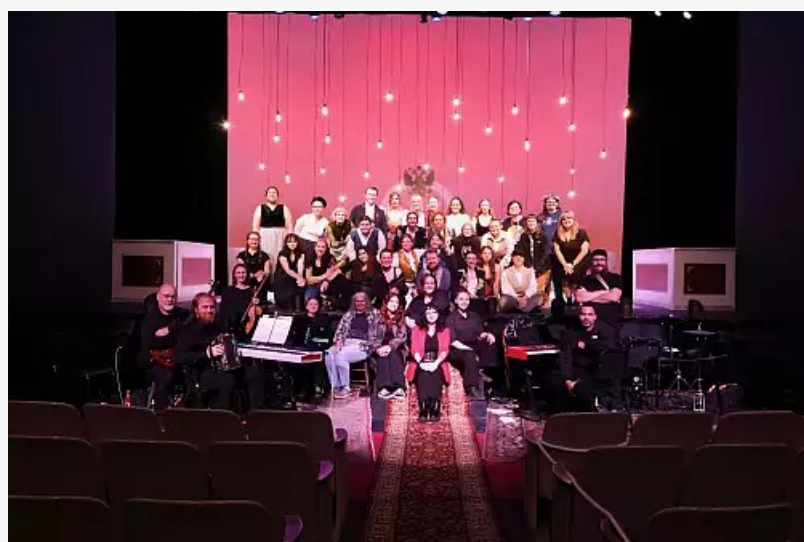
The cast and crew of Natasha, Pierre & The Great Comet of 1812 .

For more information on the arts at Sweet Briar College, please visit https://www.sbc.edu/admissions/ or contact the Office of Admissions at 434-381-6142.