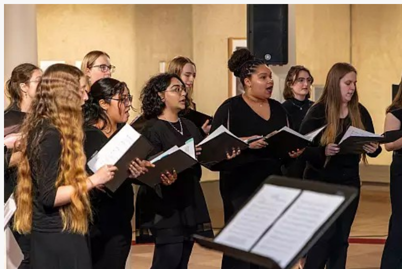
The College Choir performs their fall concert.