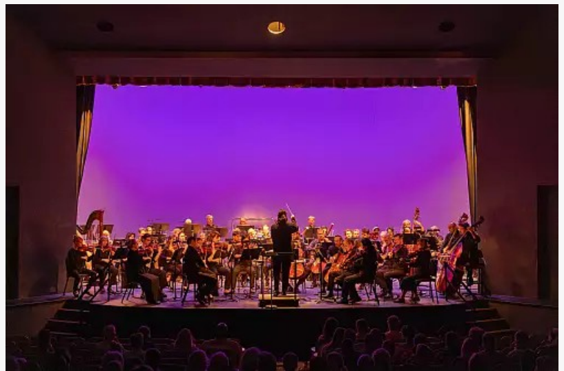
The Richmond Symphony Orchestra performs on campus.