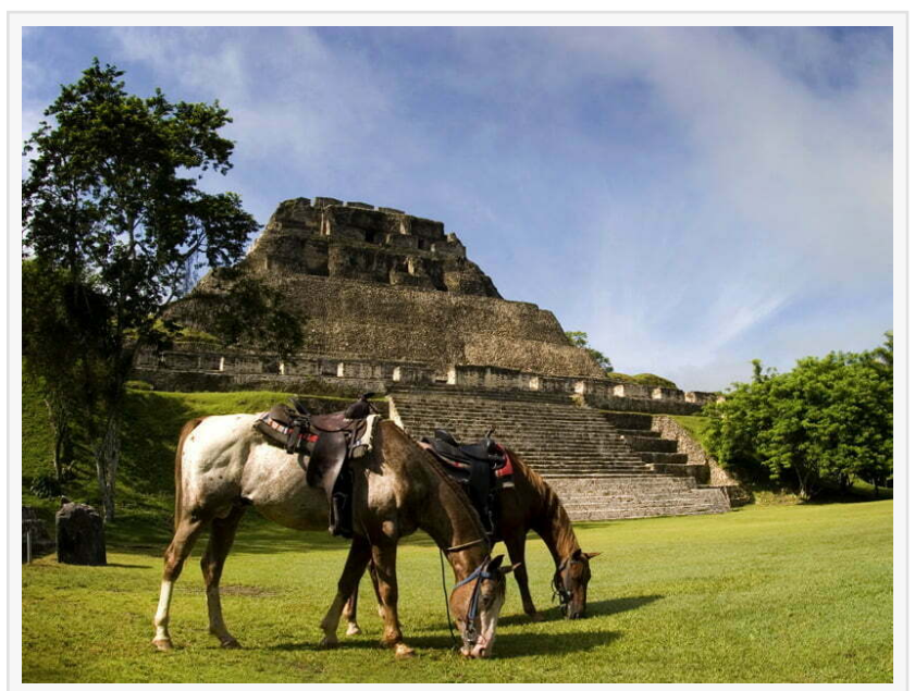
Xunantunich Horseback riding

Responding to New Regulations and Travel Trends Recent developments in tourism regulations and evolving traveler preferences have shaped the updates to Pacz Tours for 2025. Notably, the implementation of new guidelines for the <u>Actun Tunichil Muknal (ATM) Cave</u> <u>Tour</u>, which now limits groups to six participants per guide, highlights the growing emphasis on sustainable tourism and personalized experiences.