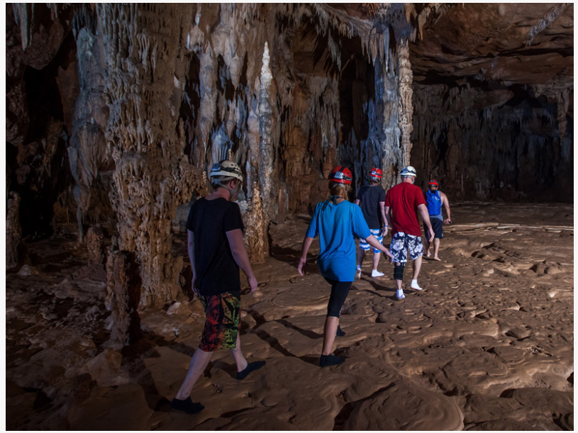
inside the ATM Cave