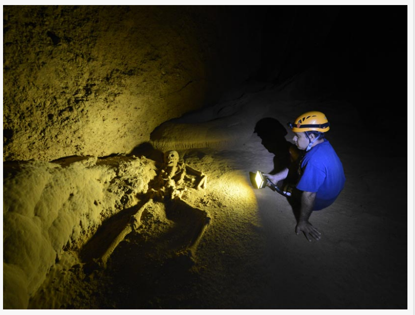
Belize Cave Tour

The ATM Cave remains one of Belize's most iconic adventure experiences, offering visitors a glimpse into the ceremonial practices of the ancient Maya. With the new group size limit of six participants per guide, <u>Pacz Tours provides a more intimate and focused experience</u>. Participants trek through lush rainforest, cross rivers, and explore the sacred cave system, which features preserved artifacts, pottery, and skeletal remains, including the famous "Crystal Maiden."