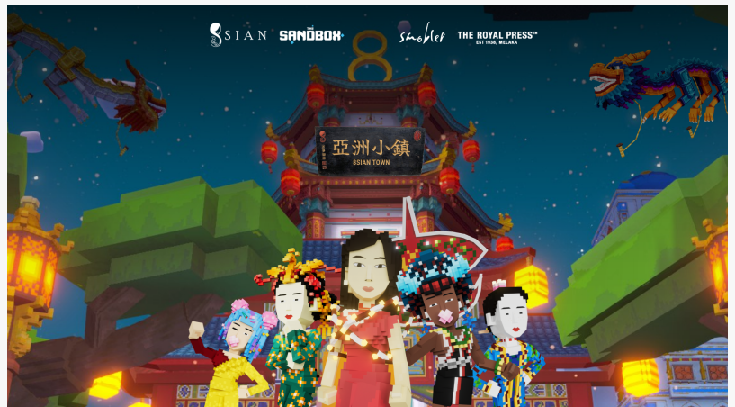
8SIAN TOWN in The Sandbox Game by Smobler