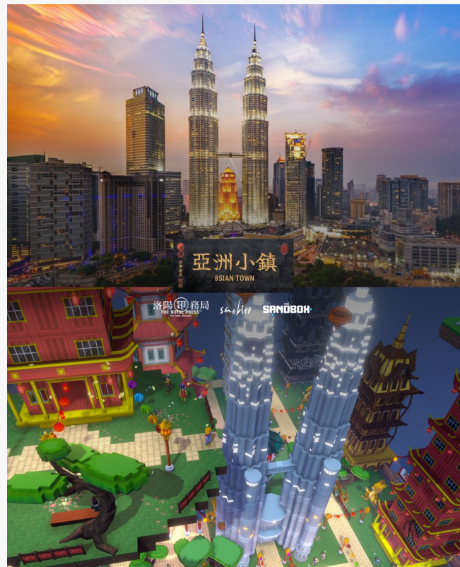
Iconic Petronas Twin Towers of Malaysia in 8SIAN TOWN recreated by Smobler