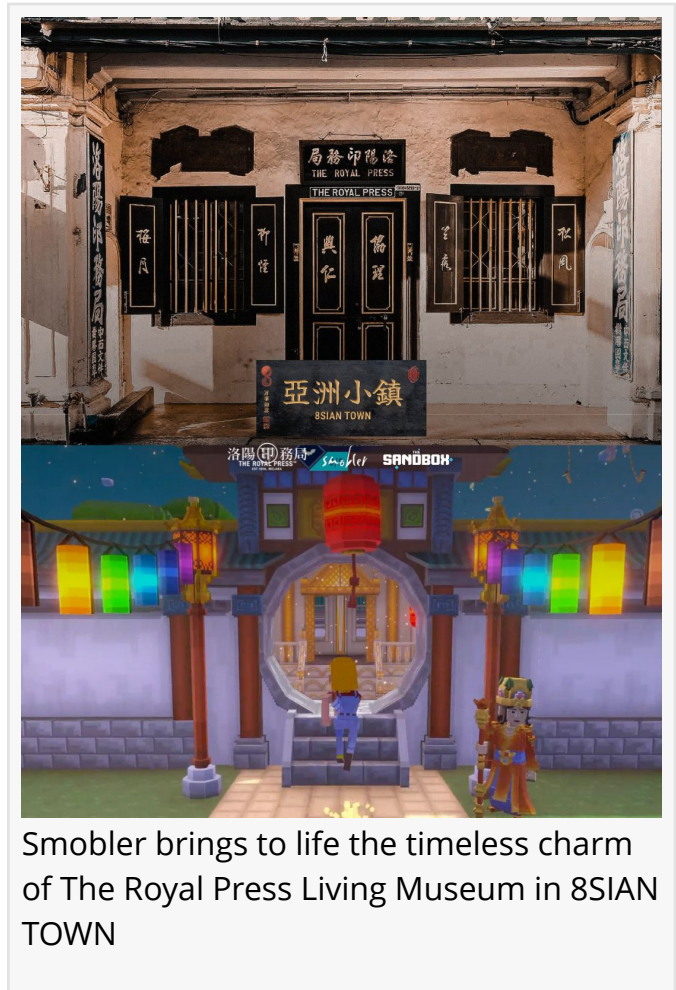
Smobler brings to life the timeless charm of The Royal Press Living Museum in 8SIAN TOWN

“At the intersection of heritage, culture, and innovation, the collaboration between Smobler,