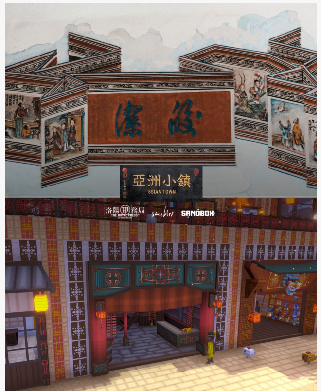
Murals in The Royal Press Living Museum as reimagined by Smobler in 8SIAN TOWN