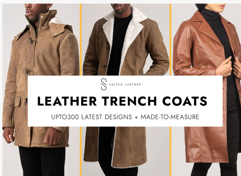
SaltCo Leather Trench Coats Collections