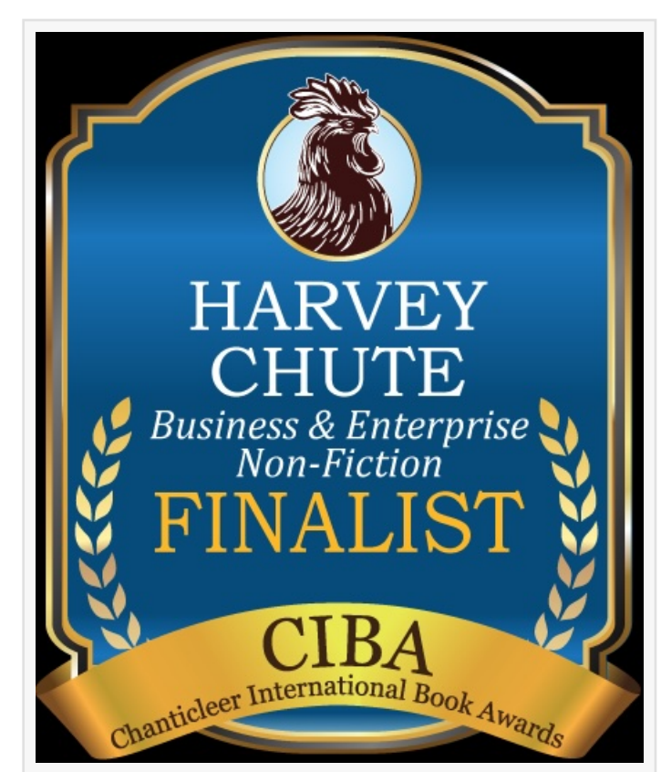
Harvey Chute Finalist Award