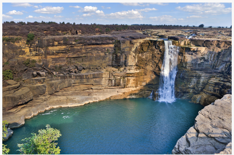
Keoti Waterfall, cascading amidst the lush landscapes of Rewa, Madhya Pradesh