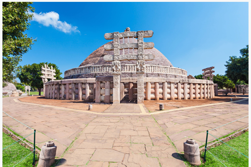
Sanchi Stupa – a symbol of India's ancient Buddhist heritage and architectural brilliance