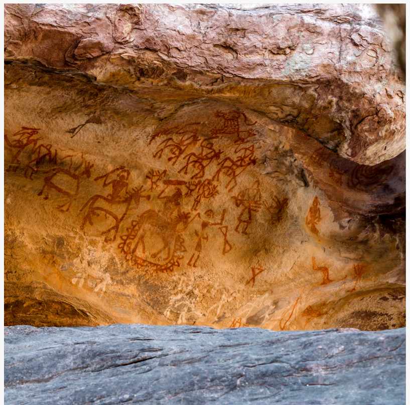
The Bhimbetka Rock Shelters, a UNESCO World Heritage Site, showcasing prehistoric cave paintings and human habitation