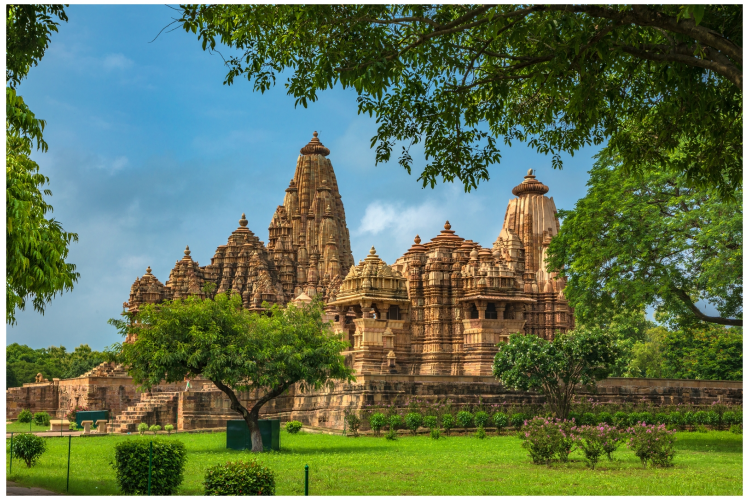
The Khajuraho Group of Temples

BHOPAL, MADHYA PRADESH, INDIA, January 26, 2025 /EINPresswire.com/ -- The Madhya Pradesh Tourism Board (MPTB) is set to host an exclusive roadshow at the Hilton Hotel in Barcelona on January 27, 2025. The event will take place shortly after MPTB's participation in FITUR 2025, one of the world's leading international tourism trade fairs, where Madhya Pradesh will showcase its cultural, spiritual, and sustainable tourism offerings.