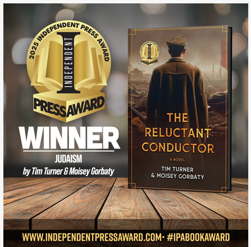
2025 Independent Press Award Winner

In 2025, the INDEPENDENT PRESS AWARD saw participation from journalists, well established authors, and small, medium and large publishers across the globe, including those residing in