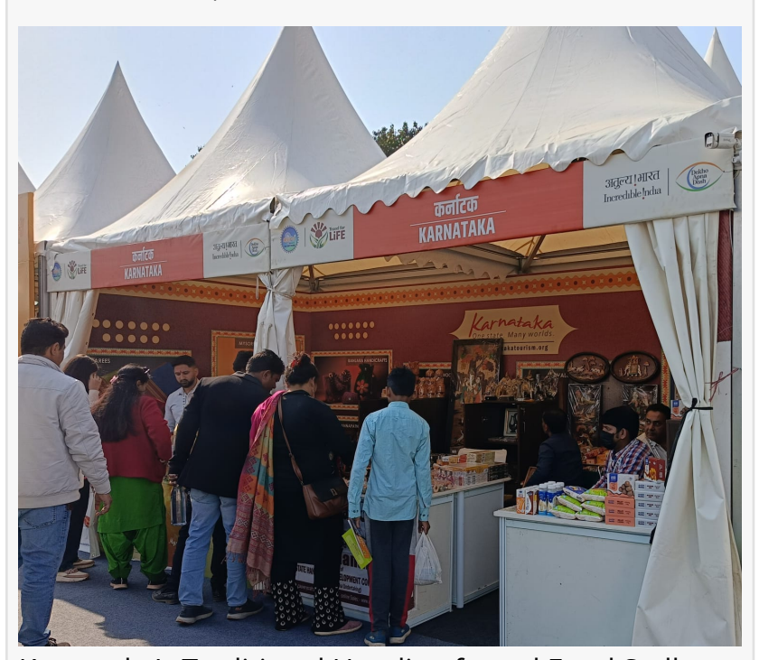
Karnataka's Traditional Handicraft and Food Stall