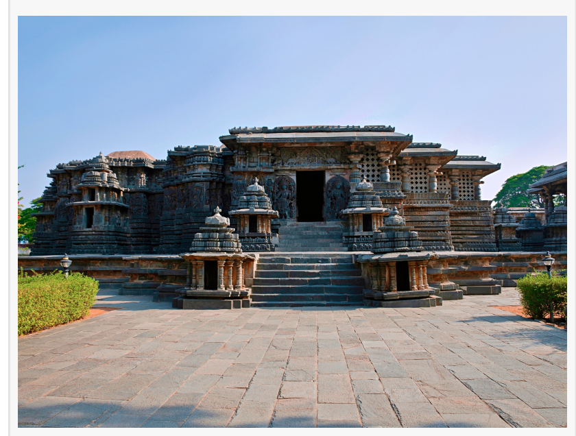
Majestic Hoysaleshvara Temple, Halebid – A timeless masterpiece of Karnataka's rich heritage

At OTM Mumbai, Karnataka Tourism will connect with the travel trade, stakeholders, and potential investors to position the state as a must-visit destination. The pavilion will emphasize Karnataka's diverse offerings, including serene hill stations like Coorg and Chikmagalur, pristine beaches such as Gokarna and Karwar, and thrilling wildlife safaris in Bandipur, Kabini, and Nagarhole National Park. Lesser-known gems like Shravanabelagola, Aihole, and Bijapur will also be featured, showcasing their historical and architectural significance.