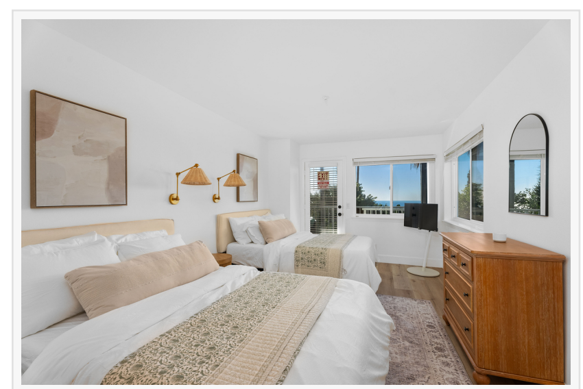
Enjoy the luxury of a Rehab Center in Southern California

ORANGE COUNTY, CA, UNITED STATES, January 28, 2025 /EINPresswire.com/ -- Oceans Luxury Rehab, a leader in premium addiction recovery services, is proud to announce the launch of its Luxury Executive Rehab Program tailored for professionals and executives in Orange County. Designed with privacy and discretion at its core, this exclusive program ensures that high-profile clients can maintain their