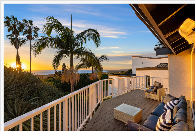
Oceans Luxury Rehab just steps away from the beach in Southern California

Clint Kreider Oceans Luxury Rehab +1 866-986-5435 info@oceansluxuryrehab.com Visit us on social media: Facebook YouTube