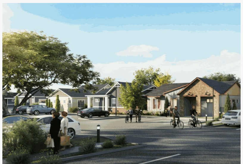
Homes at Village at Mayfair in New Braunfels

AUSTIN, TX, UNITED STATES, February 12, 2025 /EINPresswire.com/ -- Legacy MCS, a leading general contractor based in Austin with a proven track record in build-to-rent (BTR) developments , is spearheading the construction of The Village at Mayfair in New Braunfels. This project, developed by the Arizona-based Empire Group of Companies, will create 217 rental homes located in the New Braunfels' community with direct access to IH35. Construction is underway with homes becoming available in late summer or early fall of 2026.