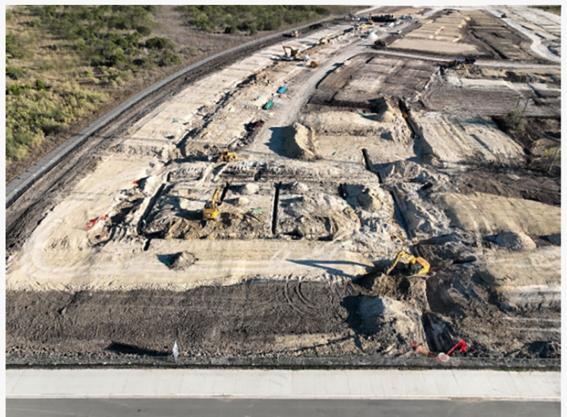
Construction at Village at Mayfair in New Braunfels Legacy MCS

Legacy MCS continues growth in the BTR and Multi-Family Rental markets, driven by a mission to create remarkable spaces that serve communities and offer exceptional returns for their clients. With a legacy rooted in quality and service, Legacy MCS is poised to continue as a important contributor in the construction landscape of Texas.