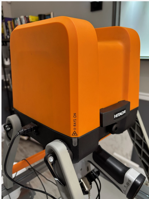
X-Ray Metal Analyzer