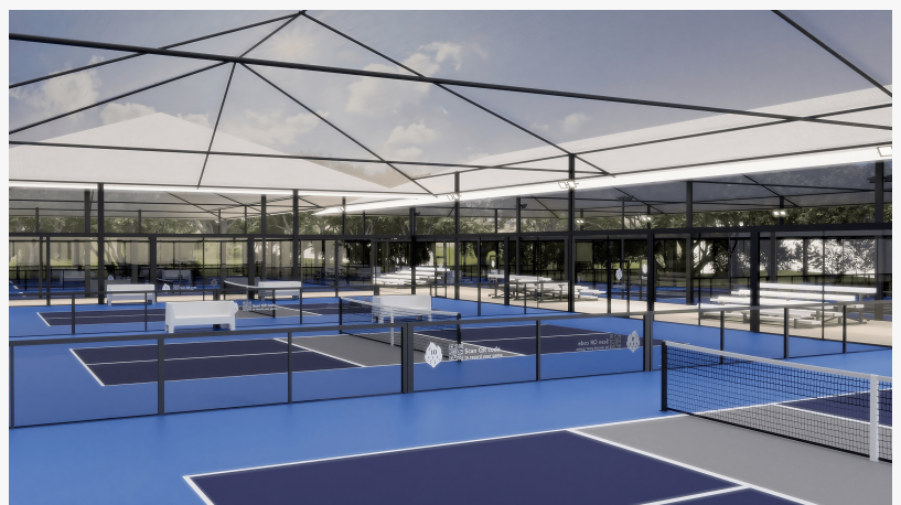
PICKLEGLASS™ Court Design

CHICAGO, IL, UNITED STATES, January 28, 2025 /EINPresswire.com/ -- Chaifetz Group ("CG") today announced a new strategic investment in PICKLETILE™, the nation's most innovative pickleball court solutions company with a focus on soundproofing and design. This investment positions PICKLETILE™ to accelerate operational growth, expand distribution networks, advance its state-of-the-art court technologies, and meet the surging demand for its groundbreaking solutions both nationwide and globally.