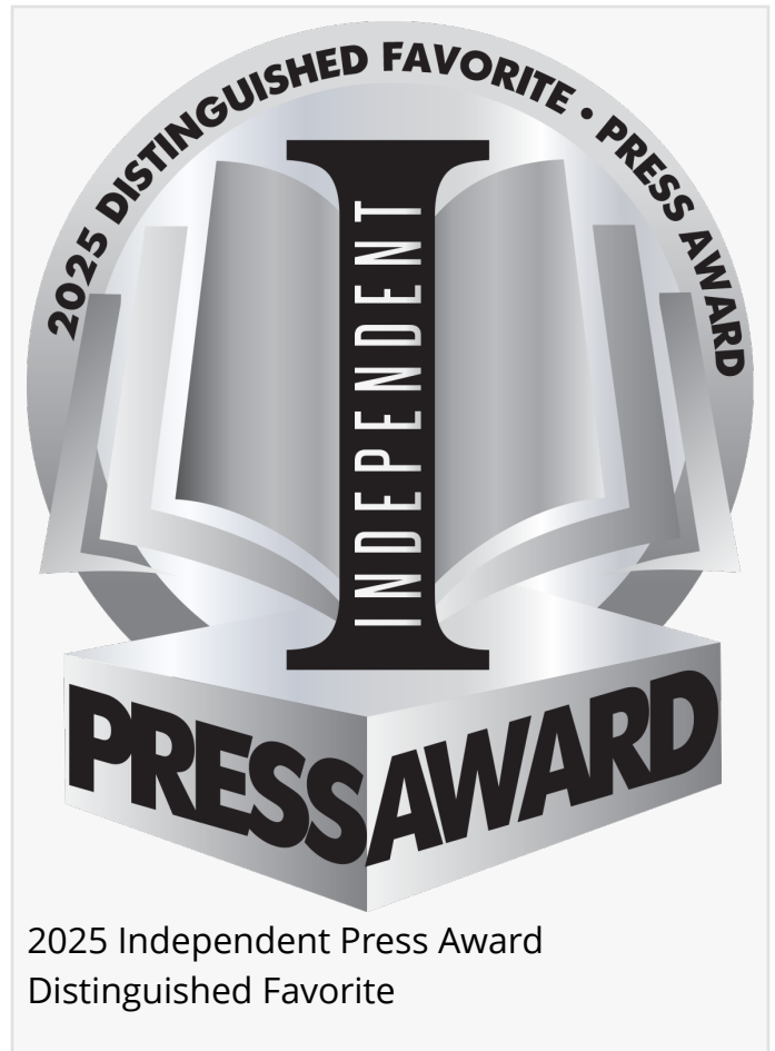
2025 Independent Press Award Distinguished Favorite

This press release can be viewed online at: https://www.einpresswire.com/article/780808705