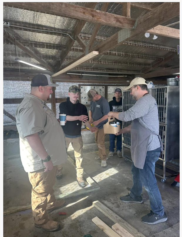
Big Door Coffee fuels the hardworking team of MRC Restoration as they construct a new safe space for animals at the Desloge City Pound.