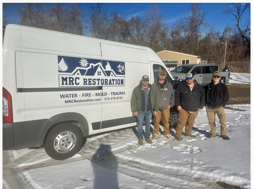
The MRC Restoration team poses with their branded van after completing a critical upgrade at the Desloge City Pound, combining restoration and construction skills to serve the community.

MRC Restoration's involvement in the city pound upgrade is part of a broader mission to serve the community through impactful projects. From restoring homes and businesses after water damage to creating new spaces that address community needs, the company strives to make a