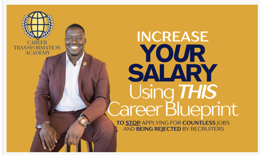
Book a Free Career Consultation Today

frameworks designed to help readers develop crucial psychological skills for career advancement. Each chapter concludes with actionable reflection exercises and detailed implementation plans.