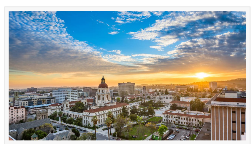
Pasadena Fire Damage Restoration

PASADENA, CA, UNITED STATES, January 28, 2025 /EINPresswire.com/ -As Pasadena recovers from the devastating Eaton Fire, JP Carpet Cleaning Expert Floor Care is stepping forward with professional <u>Pasadena</u> fire damage restoration services designed to help families and businesses rebuild and recover. With a