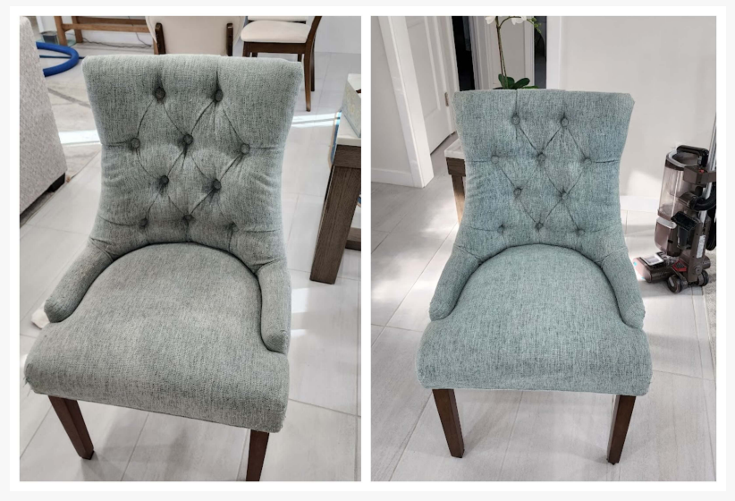
Upholstery steam cleaning in Van Nuys

step of the restoration process, utilizing personal protective equipment (PPE) and advanced