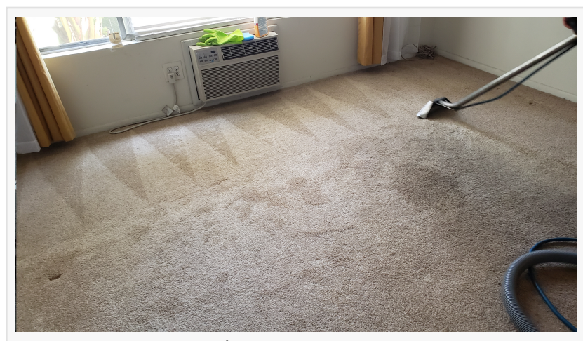
Apartment Carpet Cleaning

The company's use of professional-grade equipment, such as HEPA filters and ozone generators, ensures that homes and businesses are not only structurally sound but also safe for families and employees. By addressing air quality, structural integrity, and surface contamination, the restoration process goes beyond repairing damage to create a healthy living and working environment.