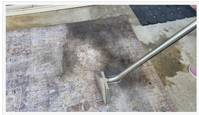
Cleaning a Persian Area Rug

Health and Safety Considerations Smoke and fire damage present significant health risks, including respiratory issues and exposure to toxic particles. The lingering effects of smoke and soot can compromise indoor air quality and cause long-term damage to property and health. JP Carpet Cleaning Expert Floor Care prioritizes health and safety in every