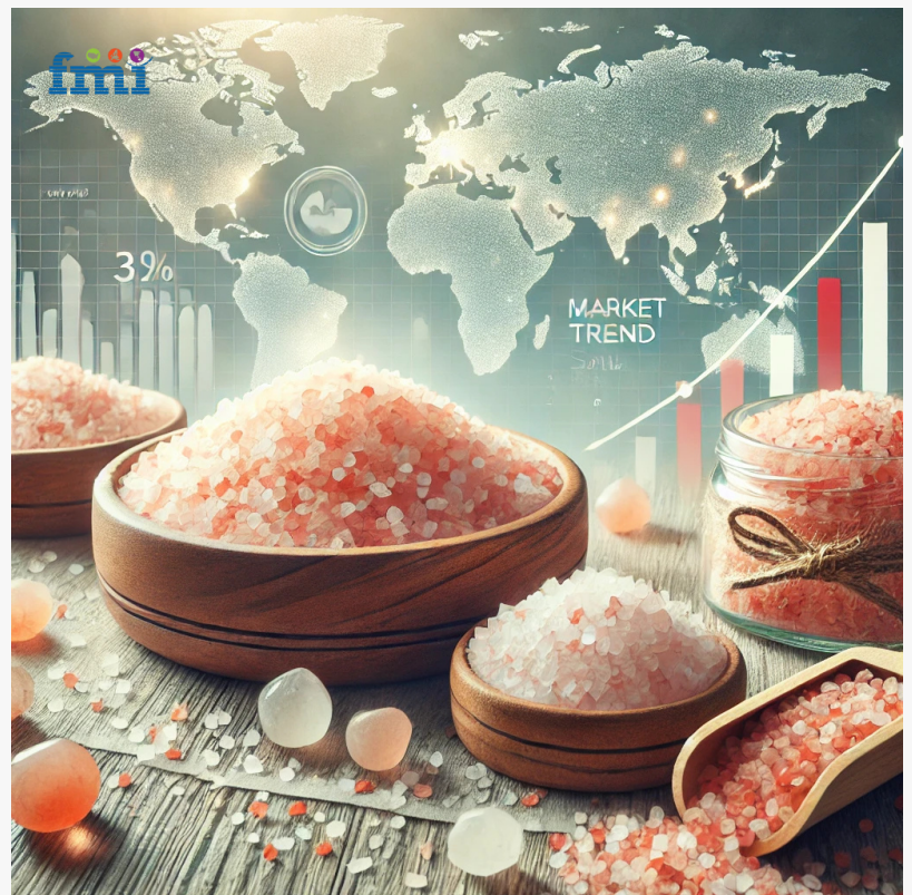
Himalayan Salt Market Analysis