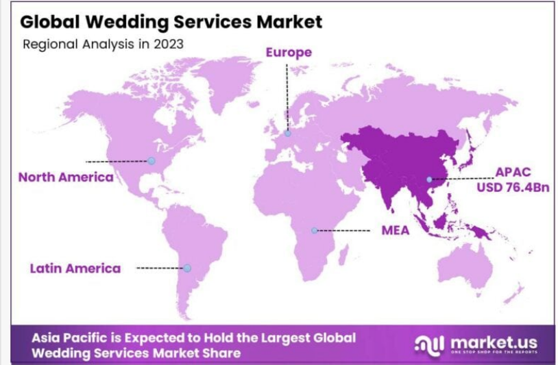
Wedding Services Market Region

processes for marriage registration and event permits is making wedding planning more convenient for couples and businesses alike. These factors collectively contribute to a supportive ecosystem for the market's growth.