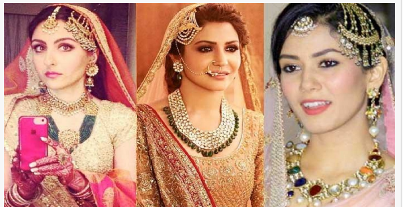
Jhoomar -Hair adornment