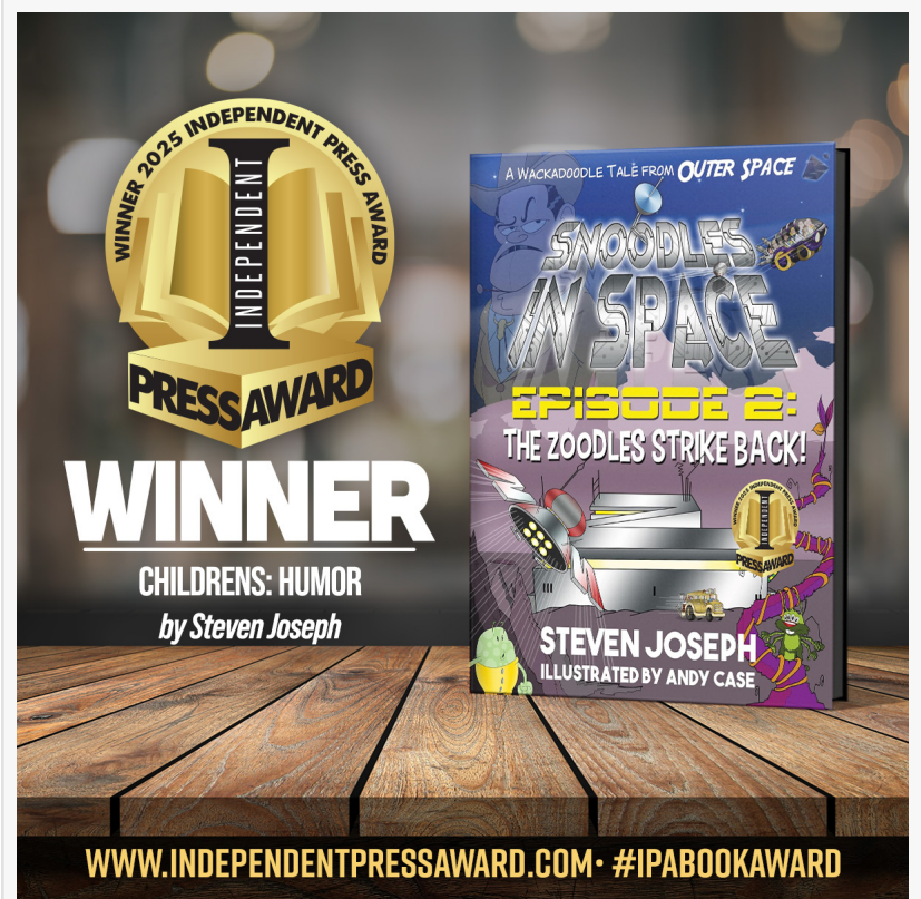
2025 Independent Press Award Winner

Can Briana and Ricky save the Earth again? Will the outcast kids on the other side of the track