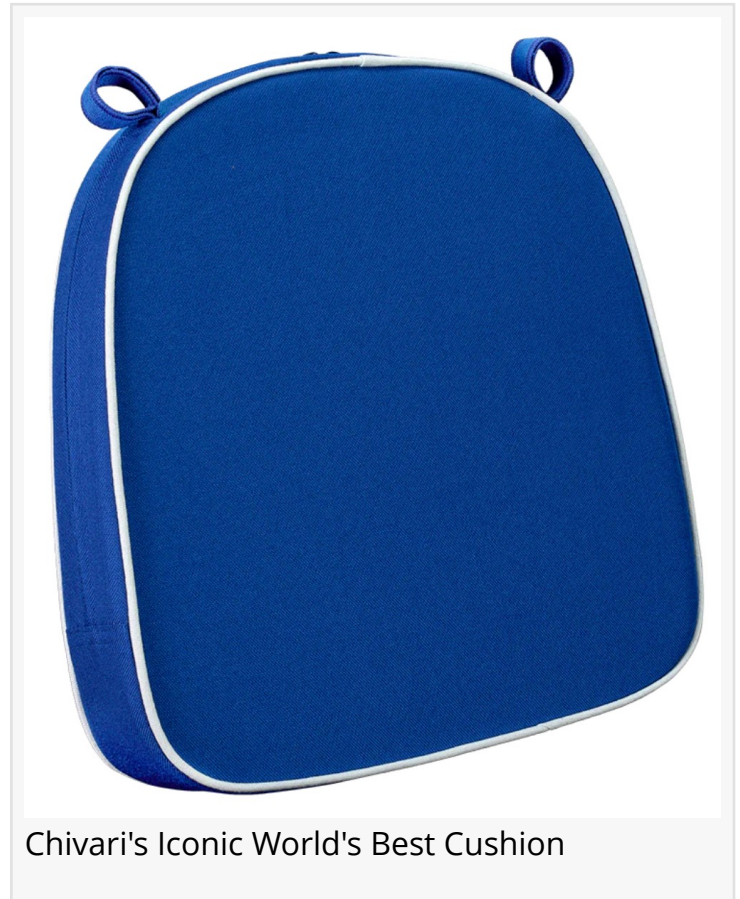
Chivari's Iconic World's Best Cushion