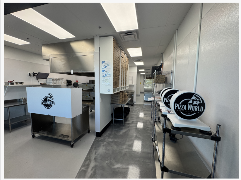
Inside Pizza World Odessa