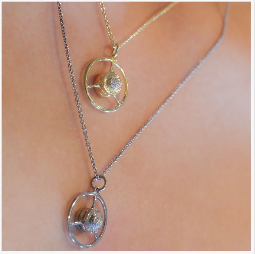
Available in Sterling Silver and 18k Gold Plated

As always, Pavé The Way<sup>®</sup> Jewelry donates 100% of profit on each sale to the charity of the purchaser's choice, adding philanthropy to the statement every piece makes. With the unique social enterprise model, Pavé The Way<sup>®</sup> Jewelry takes conscious consumerism to a new level by connecting changemakers to a broader storytelling platform with collections meant to inspire conversations of consequence while still celebrating their individual styles, passions, and advocacy.