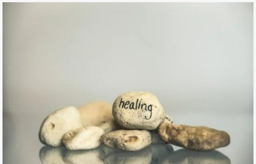
Healing creates a strong foundation