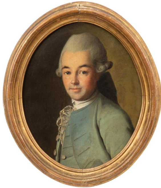
Late 18th/early 19th century French School oil on canvas painting, titled simply Portrait of a Young Man, a bust portrait, apparently unsigned, 23 inches by 19 inches (canvas, minus frame) ($9,680).