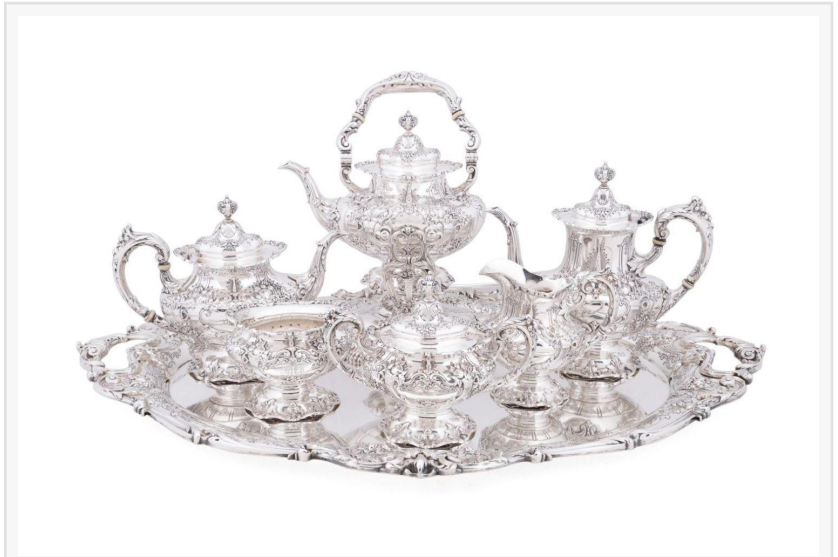
Seven-piece Reed & Barton sterling hot beverage service in the Francis I pattern (active 1907-2019), all marked appropriately and totaling 213.09 troy oz. ($16,940).