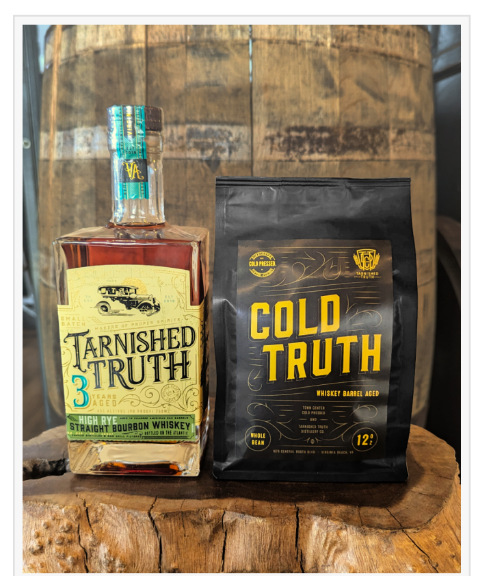
A bottle of Tarnished Truth Whiskey alongside a bag of Cold Truth Whiskey Barrel-Aged Coffee

These premium coffee beans were expertly aged in an oak whiskey barrel for 2 months, infusing Peruvian coffee beans with the rich, smooth flavor profile of Tarnished Truth High Rye Straight Bourbon Whiskey. The result is a perfect blend of robust coffee and distinct whiskey notes, creating a unique and indulgent experience for coffee and whiskey lovers alike. The collaboration brings together two iconic local brands, both passionate about quality, craftsmanship, and a deep love for their community.