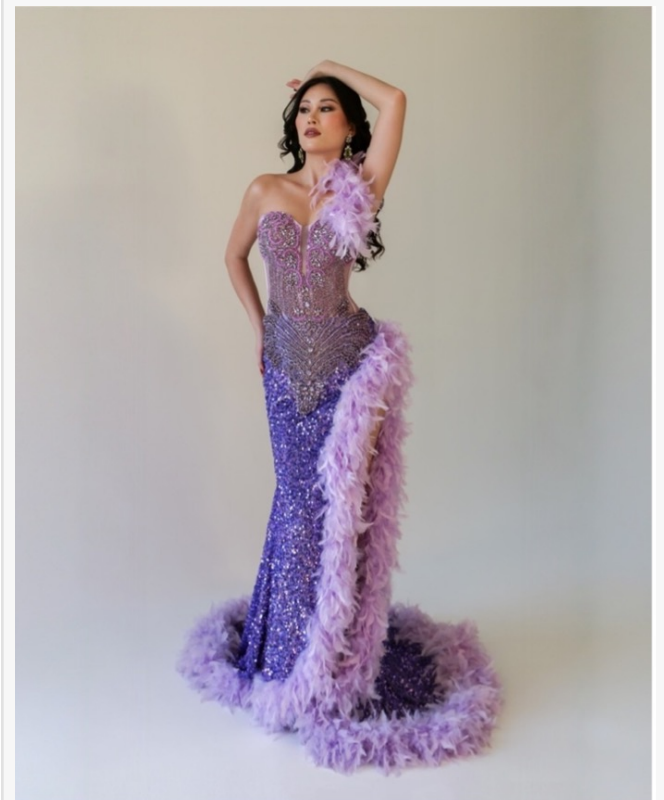
Diana Mahrach Couture