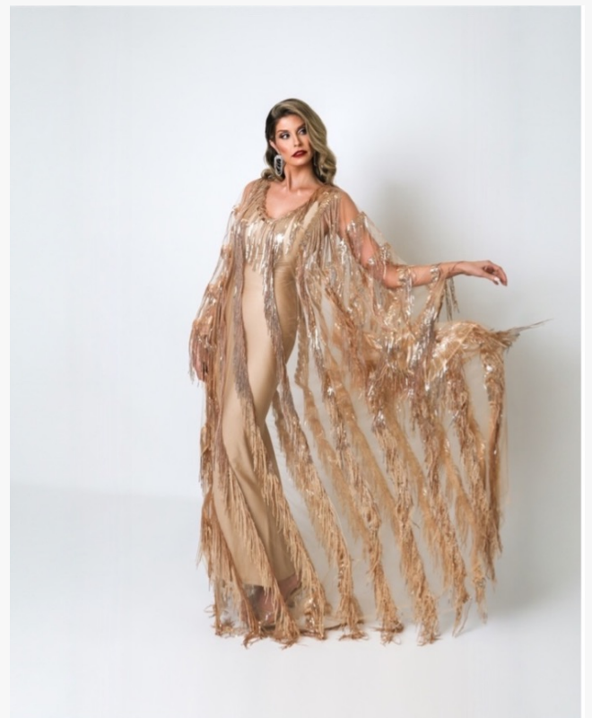
Diana Mahrach Couture