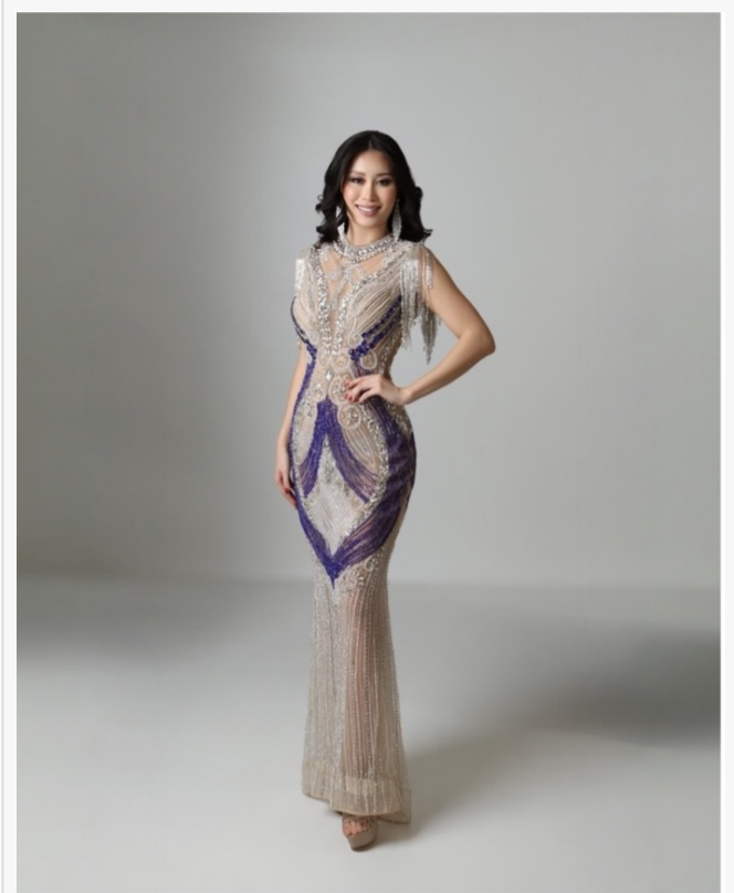
Diana Mahrach Couture