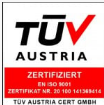
ISO 9001 Certification