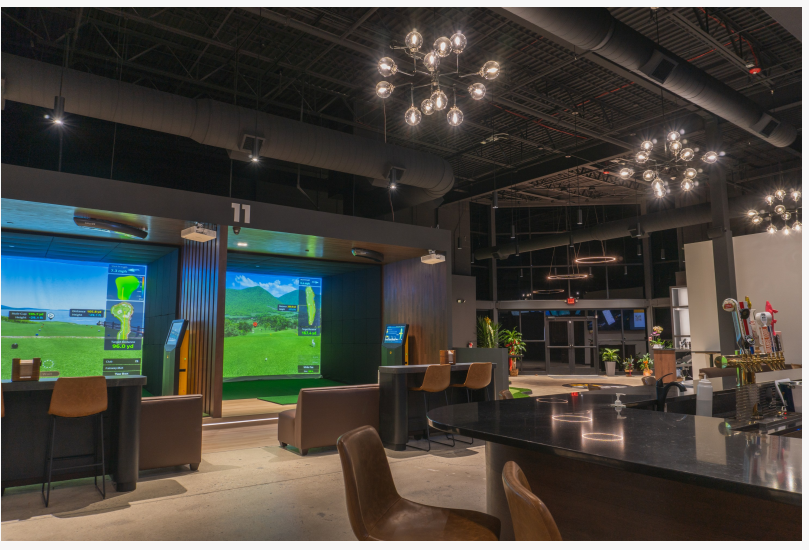
Golf VX - Arlington Heights Venue Interior

play, practice, competition, and casual fun. The gameplay is further enhanced by Golf VX's auto-tee and touch-keypad hardware which eliminates the need to pick up balls or adjust alignment with a computer mouse, allowing players to hit 30% more shots compared to other simulators and indoor golf venues. Guests can also indulge in food and beverage selections that satisfy all tastes with evolving, and expertly crafted menus. The Makr Shakr robot bartender, TONI, steals the show with its two robotic arms capable of creating over 80 drinks per hour, with