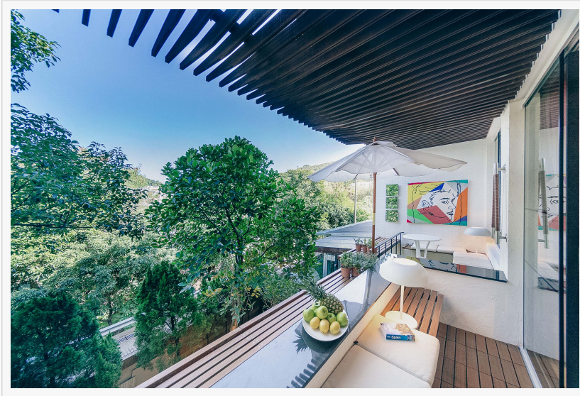
Lush private garden, rooftop terrace, and balcony for outdoor living

The expansive living and dining areas flow effortlessly into an L-shaped private garden, while a spacious balcony provides the perfect setting for al fresco dining. Two state-of-the-art open kitchens, one in the living room and another in the dining space, are equipped with top-tier appliances, including a retractable hood, catering to both casual and formal entertaining. The primary suite spans the top level,