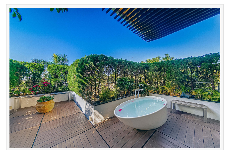
Resort-style amenities and 24-hour professional security

Fanling, located in the New Territories of Hong Kong, is a hidden gem blending natural beauty, cultural heritage, and modern convenience. Surrounded by lush green hills and picturesque landscapes, the area offers countless opportunities for outdoor enthusiasts, from hiking trails at Wu Tip Shan and Lung Yeuk Tau Heritage Trail to relaxing at Fanling Golf Club. A short 15-minute drive leads to the China border and the charming Tai Po, where visitors may enjoy waterfront