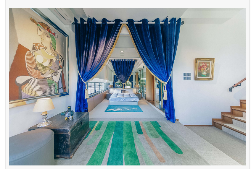
Bespoke interiors with artisanal furniture and global design touches

featuring a private terrace, dual walk-in closets, and a Greece-inspired spa bath, creating a personal retreat within the home. The second ensuite bedroom also enjoys balcony access, further enhancing the residence's indoor-outdoor lifestyle.