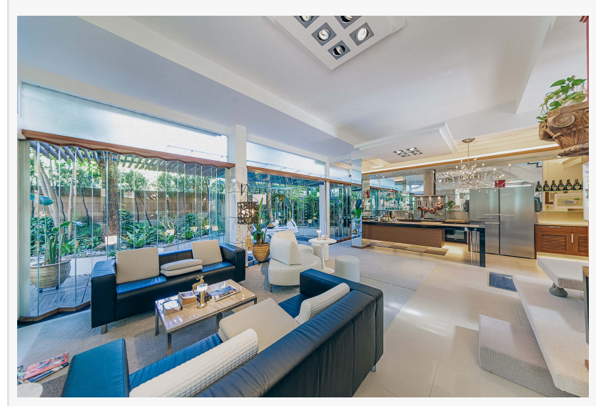
Designer home steps from Fanling Golf Course in gated Miami Crescent

blends modern luxury with the tranquility of Hong Kong's lush countryside. Boasting high ceilings, glass walls, skylights, and an open floorplan, the home is thoughtfully designed to