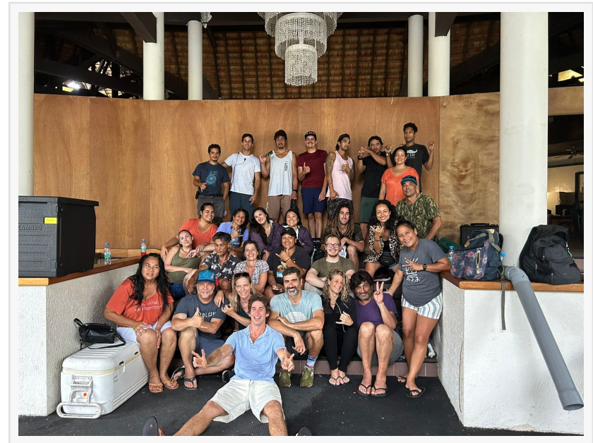
A few of the extraordinary Tahitian cast and crew for 'Waltzing with Brando.'

Air Tahiti Nui, whose support was instrumental in ensuring seamless travel logistics for the cast and crew,