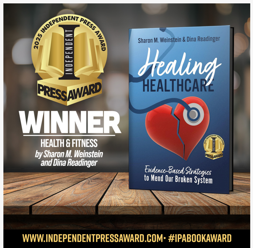
"Healing Healthcare: Evidence-Based Strategies to Mend Our Broken System" by Sharon M. Weinstein and Dina Readinger

"Healing Healthcare" is a poignant exploration of the intricate challenges within the healthcare landscape post-pandemic and solutions for change. Faced with shortages and systemic upheavals, the healthcare system currently teeters on the brink of collapse, prompting