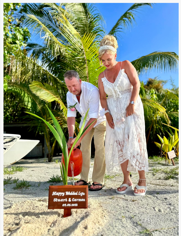
After renewing their vows, a couple plants a tree

At the heart of this initiative is Cinnamon Hotels & Resorts' commitment to sustainability through its Environmental, Social, and Governance (ESG) strategy. The palm tree planting activity at Cinnamon Hakuraa Huraa Maldives is not merely an offering for guests but a conscious effort to