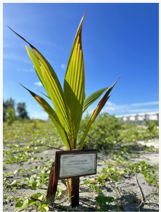
A newly planted tree