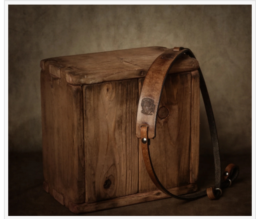
Buck and Bull Leather Turkey Tote -

Buck and Bull Leather specializes in creating custom leather products designed for outdoor enthusiasts. Committed to quality craftsmanship, each item is handcrafted using premium materials sourced from the Southern United States. The company takes pride in offering personalized options that enhance the uniqueness