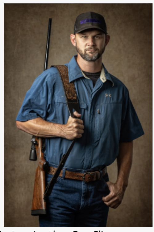
Buck and Bull Custom Leather Gun Slings -

pursue turkey game. This tote is crafted from high-quality leather and features an ergonomic design that makes carrying your catch easier and more comfortable. Like the rifle slings, these totes can be personalized with names or initials, making them excellent gifts as well.