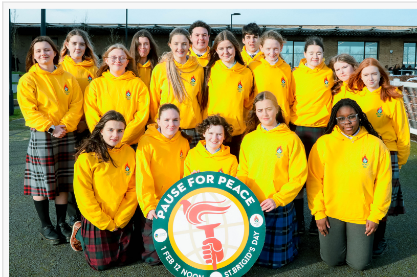
Children with Pause for Peace logo