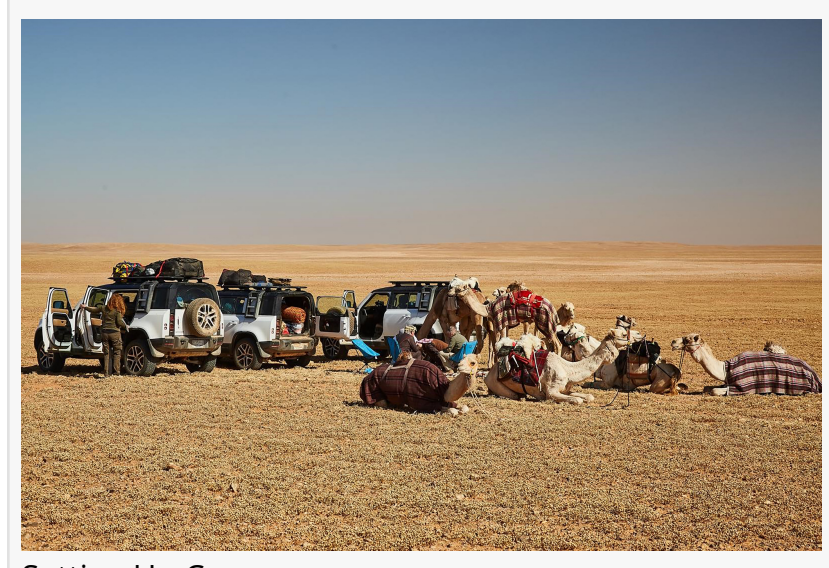
Setting Up Camp