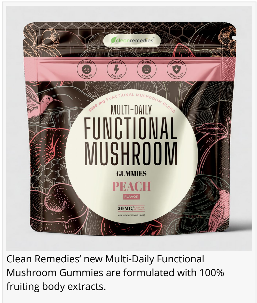
Clean Remedies' new Multi-Daily Functional Mushroom Gummies are formulated with 100% fruiting body extracts.

AVON, OH, UNITED STATES, February 3, 2025 /EINPresswire.com/ -- Clean Remedies, a well-known THC and CBD wellness company, is excited to announce the release of two products as part of a new collection: the Multi-Daily Functional Mushroom Tincture and Multi-Daily Functional Mushroom Gummies. These products, part of the brand-new Functional Mushroom collection , signify a step forward for the company as it broadens its wellness offerings. Currently, Clean Remedies' portfolio includes CBD gummies and tinctures, Delta 8 and 9 THC products , and more, available both online and at their Avon, Ohio, dispensary.