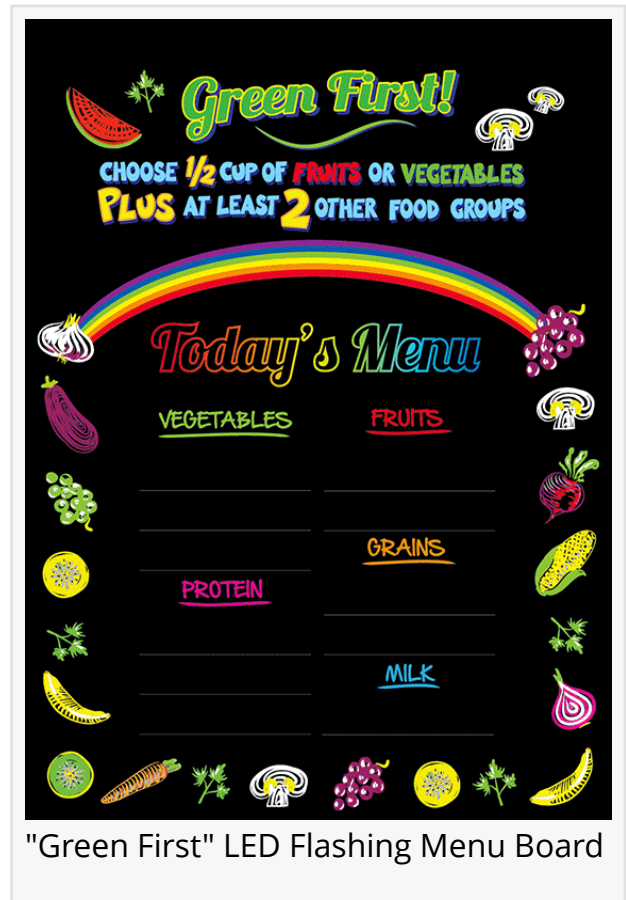
"Green First" LED Flashing Menu Board

Green Edge Systems specializes in innovative menu board solutions that prioritize healthy eating and streamline cafeteria operations. The company's menu boards are strategically designed to be placed in front of service lines, unlike traditional wall-mounted or ceiling-hung digital boards, as well as mounted on the wall and on service counters. . These boards are customizable to reflect schools' unique branding, including mascots and colors.