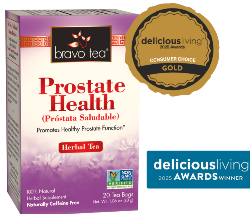
Prostate Health Tea - Gold Award

For a full list of winners please visit deliciousliving.com and pick up the March 2025 issue of delicious living at your local natural health retailer.