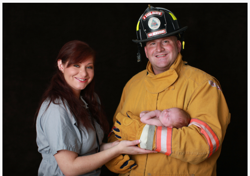
Newborn safely surrendered in caring arms

A Safe Haven for Newborns has served as the Florida Safe Haven Program since 2001, providing direct assistance to over 7000 women and saving more than 421 newborn infants, now living with forever families. A key component to the success of the program is the unique partnership, extending more than 24 years, with Fire, EMS, Hospitals, The Department of Children and Families, Law Enforcement, Social Services and many other agencies. Watch a short video on our partnership.