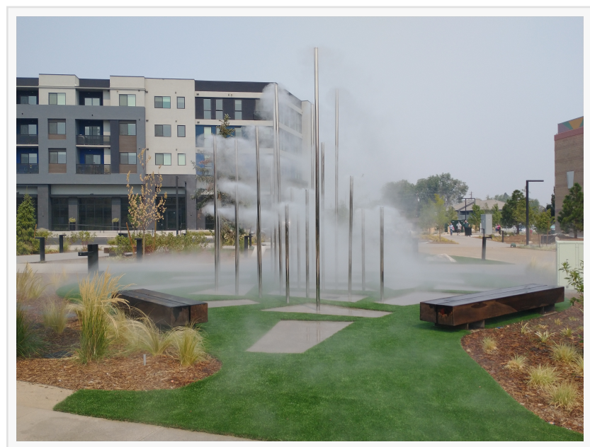
Koolfog Misting Poles Producing Fog Effects in a Landscape Park Project

Koolfog's misting poles are low maintenance due their durability with easy access for upkeep or repair. Fountain and water feature designers often implement control systems to synchronize light, music or rhythmic pulse, that can include mist and fog features to elevate the overall interactive experience. Koolfog's new misting poles feature a more robust mist (i.e. fog) output with an alternative larger diameter format. The new model has additional fog nozzles to provide greater visual impact and more cooling.