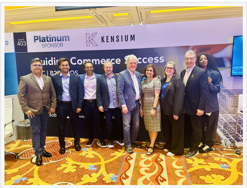
Kensium Team at Acumatica Summit 2025

Leading The Way In Unified, ERP-Connected Commerce Solutions