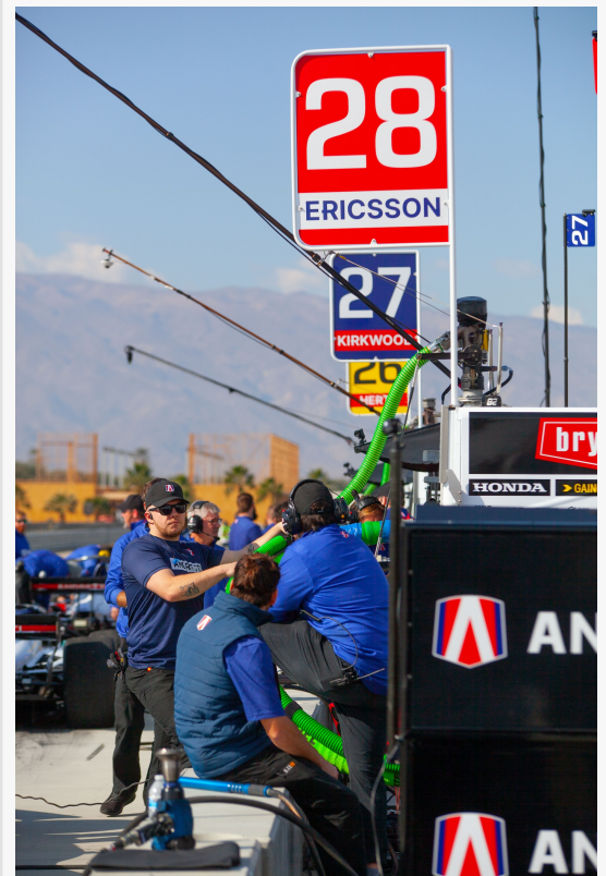
Thermal Club INDYCAR Grand Prix March 21-23