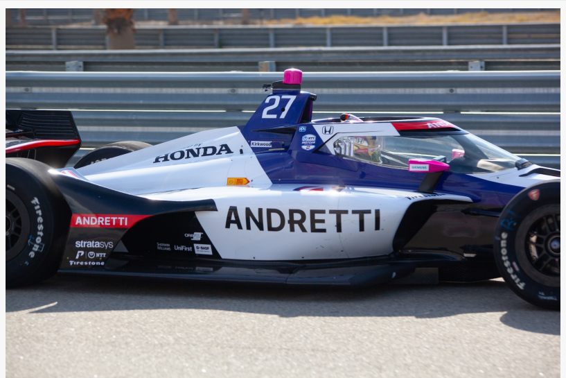
The Andretti Global team

THERMAL, CA, UNITED STATES, January 29, 2025 /EINPresswire.com/ -- The Thermal Club recently hosted track evaluations for NTT INDYCAR SERIES drivers ahead of the inaugural Thermal Club INDYCAR Grand Prix, which will take place March 21-23. Passes for the event are now on sale at www.thermalgp.com .