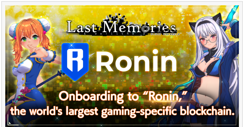
De:Lithe Last Memories

Since its global release on August 15, 2024, the game has reached #1 in the game category on both the Apple Store and Google Play, with over 500,000 downloads. As a blockchain game, it sold out NFTs worth over 150 million yen in pre-sales before the release date, and has sold