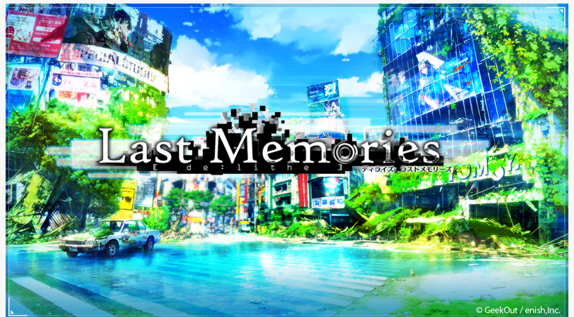
De:Lithe Last Memories