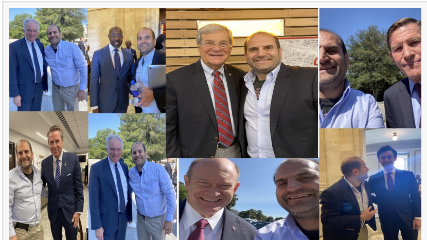
TravelingWiki Foundation Engaging Recently with Thirty US Senators (D&R), Multiple Governors, the White House, and Approximately Ten Ambassadors. Photo Includes Recent Engagement with 7 Current or Recent US Senators and the Former Vice Chair of the House Republicans

Part of the impetus of TravelingWiki's rapid growth initiatives, engaging directly with the next generation of the workforce, is the opening of experts on Neurodiversity at CES that 53% of GenZ