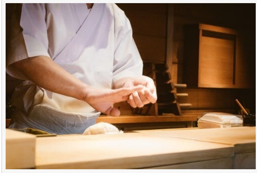
Sushi-Making Experience 2

Workshops to Experience Japanese Food Culture Sushi-Making