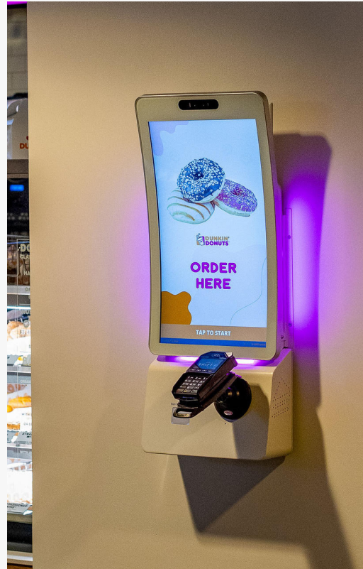
Pye Dunkin' Beignet Kiosk