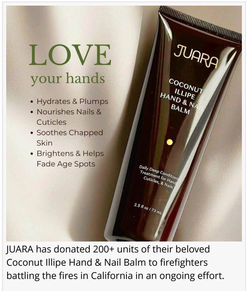
JUARA has donated 200+ units of their beloved Coconut Illipe Hand & Nail Balm to firefighters battling the fires in California in an ongoing effort.