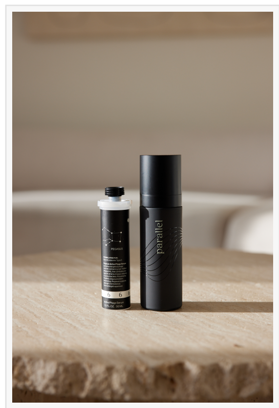
Patients receive a Custom Active Phage Serum after understanding their skin microbiome across different areas of their face and/or body

Parallel Health's approach has garnered significant industry recognition, including being named a Top 0.2% finalist at TechCrunch Disrupt and receiving accolades like Fast Company's "World Changing Idea." By addressing microbial imbalances, often linked to skin conditions, the company positions itself as a viable alternative to antibiotics and harsh corticosteroids, which have long been overused in dermatology.