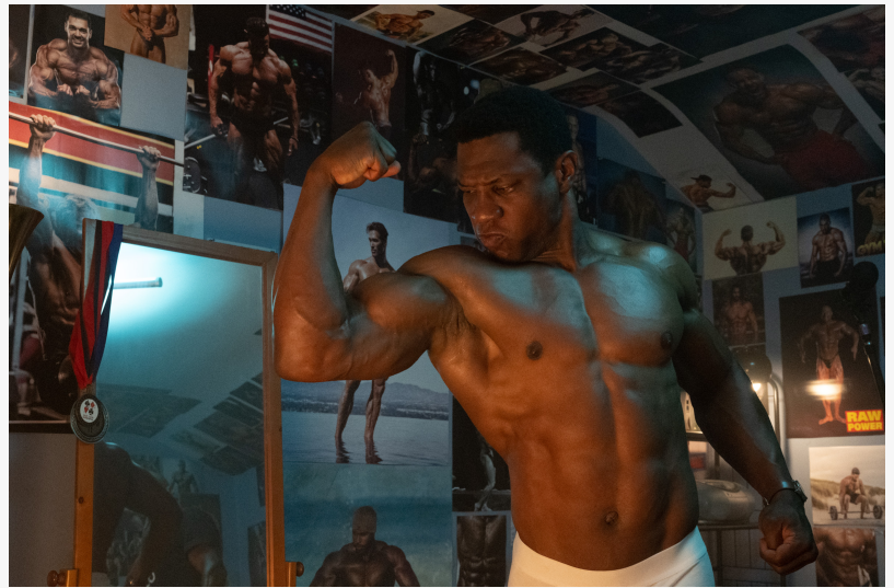
Jonathan Majors in Magazine Dreams

Killian Maddox is consumed by his dream of becoming a world-famous bodybuilder and one day gracing the cover of fitness magazines. He lives a lonely, regimented life, and his relentless drive for perfection only pushes him deeper towards self-destruction, but beneath his tenacious pursuit of superstardom lies a desperate, aching need for human connection. As he battles both