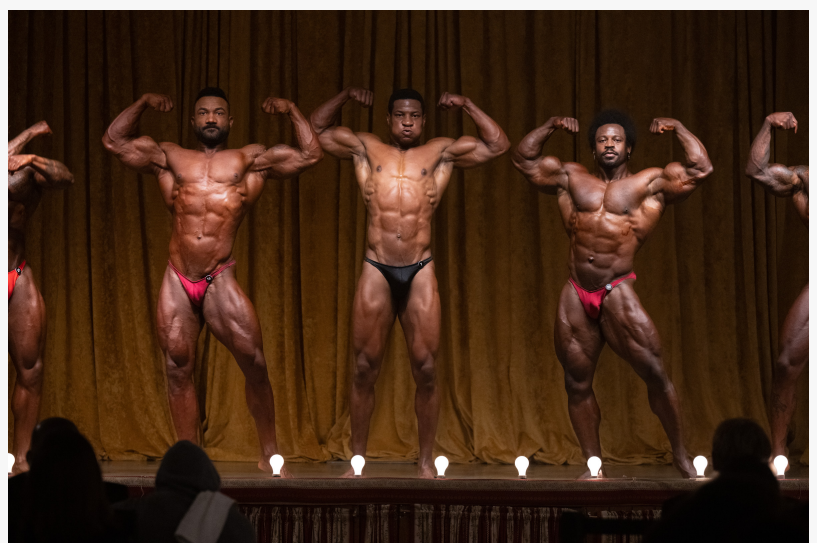
Jonathan Majors in Magazine Dreams

MAGAZINE DREAMS, which stars Majors alongside Haley Bennett, Taylour Paige, Harrison Page, and Mike O’Hearn, will set the stage for another groundbreaking year of celebrating Black storytelling on the big screen. Majors, who is also a celebrity ambassador for the 2025 PAFF, will attend hitting the red-carpet alongside a star-studded list of celebrities. He will be introduced by actress Meagan Good (“Harlem”).